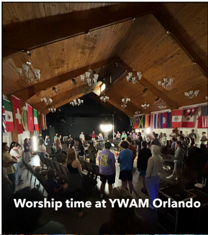
Worship time at YWAM Orlando